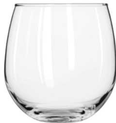
Stemless Red Wine 16.75oz (222)