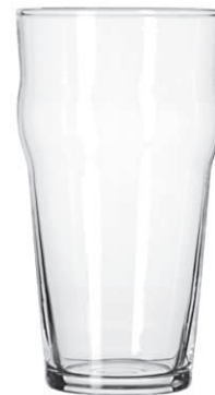
English Pub 16oz (14806HT) 20oz (14801HT)