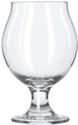
Belgium Beer 16oz (3808)