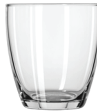
Embassy Rock 10.5oz (1512)