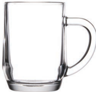
Haworth Mug 10oz (5724)