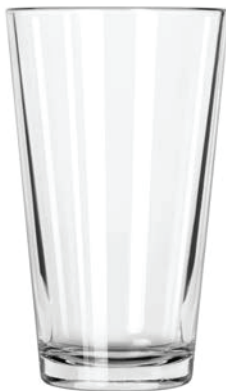
Mixing Glass 16oz (5139)