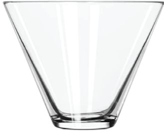
Stemless Martini 13.5oz (224)