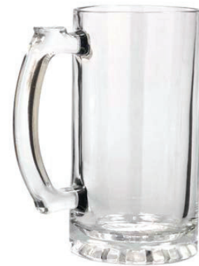
Econo Beer Stein 16oz