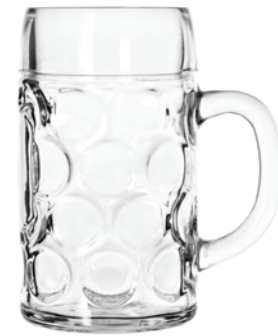
Oktoberfest 0.5L (12029521) 1L (12030021)