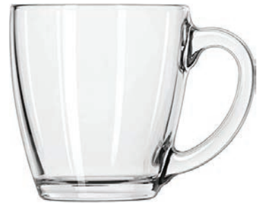
Tapered Mug 15.5oz (5344)