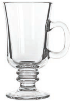
Irish Coffee 8.5oz (5295)