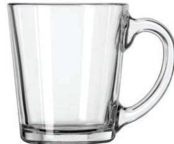
All Purpose 13.5oz (5544)