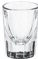
5126 Fluted Whiskey 2oz