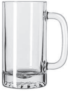
Sports Tankard 16oz