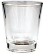
Econo Shot Glass 2oz