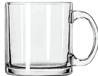
Nordic Mug 13oz (5213)