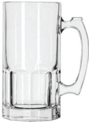
Super Mug 1L / 34oz