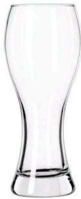
Pub Pilsner 16oz (1631) 23oz (1611)