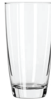
Embassy Cooler 16oz (12264)