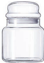
Candy Jar 22oz (70996)