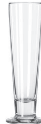
3823 Tall Beer 14.5oz

Setup Charge/Colour $40(G) Repeat Setup/Colour $20(G) 4 Colour Process setup $200(G) Halftone Setup $50(G) 2nd side (same) $0.60(C) 2nd side (different) $0.70(C)