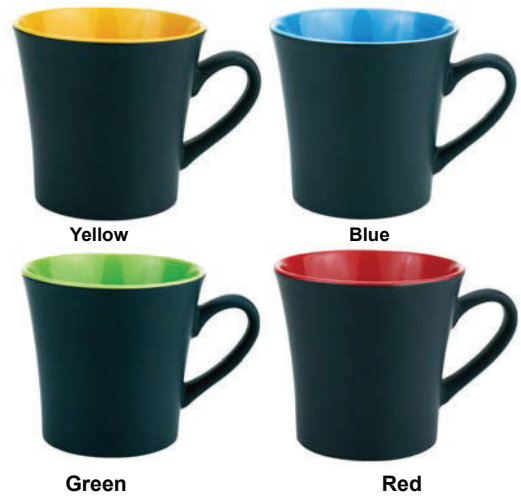
1526S - Matte Black/Colour in Veneto - 12oz Imprint size: 2" h x 2" w - 36/case, 32 lbs