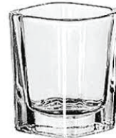
Square Shot 2oz