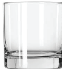
Executive Rock 10.25oz (2338) 12.5oz (2339)