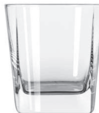
Sterling DOF 12oz (2205)