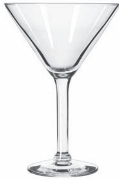
Martini Glass 8.5oz (8485) 10oz (8480)