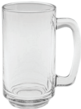
Econo Beer Stein 13oz