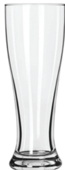
Grand Pilsner 12oz (1612) 16oz (1604) 23oz (1610)

Setup Charge/Colour $40(G) Repeat Setup/Colour $20(G) 4 Colour Process setup $200(G) Halftone Setup $50(G) 2nd side (same) $0.60(C) 2nd side (different) $0.70(C)