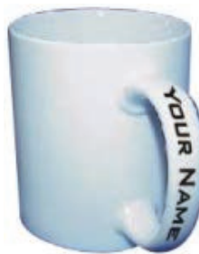
Print on Handle