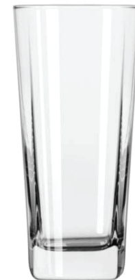
Sterling Cooler 16oz (2206)