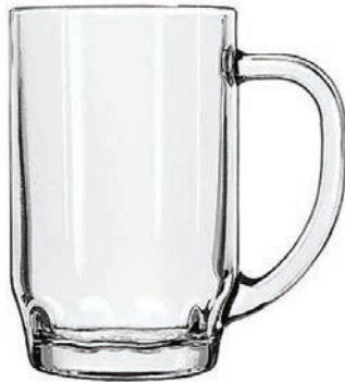
Thumbprint 19.5oz (5303)