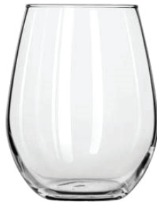
Stemless Wine 5oz (260) 9oz (207) 15oz (213) 17oz (221)