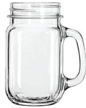
Drinking Jar 16oz (97084)