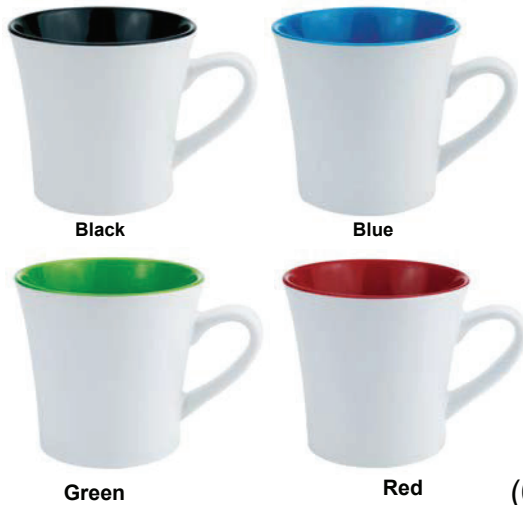
1527S - Matte White/Colour in Venetia - 12oz Imprint size: 2" h x 2" w - 36/case, 32 lbs