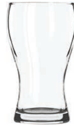
Mini Pub Glass 5oz (4809)