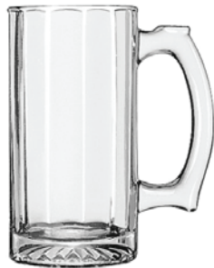
Sports Tankard with Panels 12oz