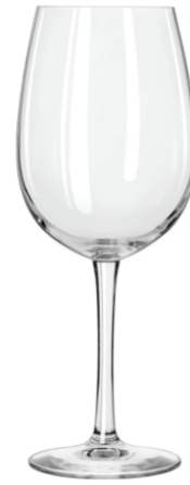
Cabernet 12.5oz (7556SR) 16oz (7557SR)