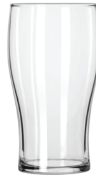
Tulip 16oz(4808) 20oz(4803)