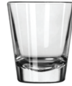
Shot Glass 1.75oz