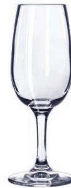
Ice Wine 3.75oz (8588SR)