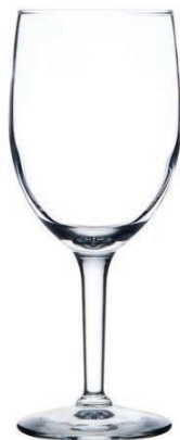
Wine Taster 6.5oz (8466)