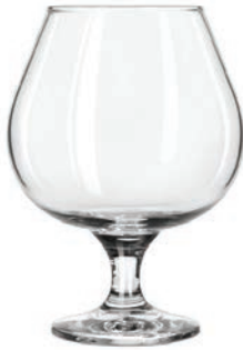
Brandy 11.5oz (3705)