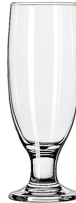
Embassy Beer 12oz (3725)