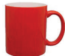
Red Out/ White In