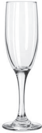
Nuance Flute 6oz (3795)