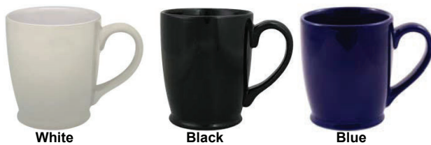
8919 - Kona - 15oz Imprint size: 2" h x 3" w - 36/case, 43lbs