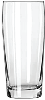
Wallibecher 16oz (14816HT) 20oz (196)