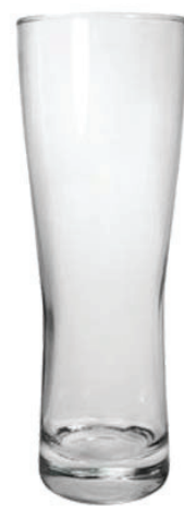
Oslo Pilsner 16oz H6283 & 20oz H6288