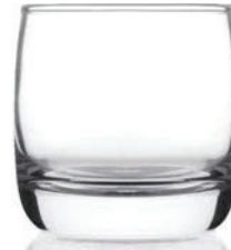
10007 Nordic Rock 10.5oz