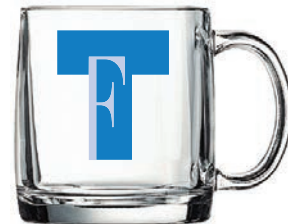
22097 Nordic Mug 13oz