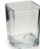
19188 Square Shot 2.5oz