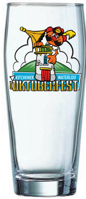
Wallibecher 16oz (C5872) 20oz (C3526)