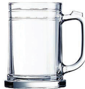
58664 Koblenz 15oz