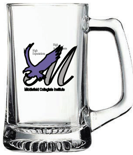
Sports Stein 15oz (53331) 25oz (53404)