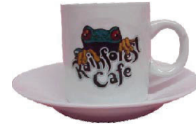
TC3 - 4oz