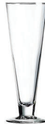
N2644 Classic 14oz