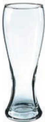
G3844 Pub Pilsner - 16oz 36230 Pub Pilsner - 20oz 36229 Pub Pilsner - 23oz