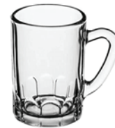
P5654 Boreal 3oz