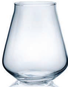
Hugo P5987 - 13.25oz