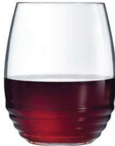
Eminence J2634 - 11oz J3377 - 17oz