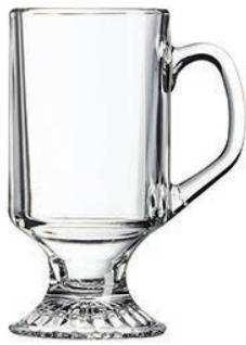
53403 Footed Mug 10oz