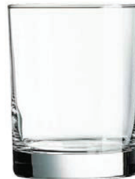
Executive Rock 11oz (53224) 14oz (53232)