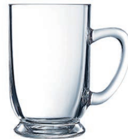
H7319 - Bolero 16oz