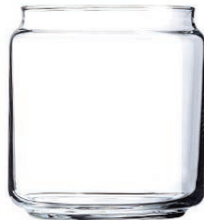
64844 Candy Jar 16oz