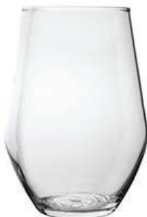
Concerto J6247 - 11.5oz J5661 - 19oz