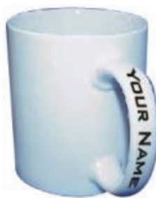
Print on Handle