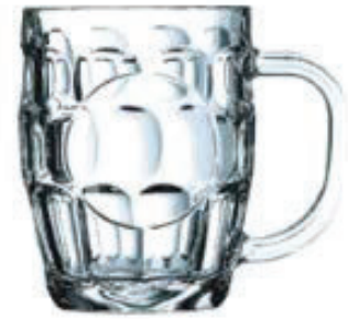
38518 Britannia 19.5oz