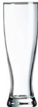
Grand Pilsner 12oz (21054) 16oz (21053) 20oz (19416) 23oz (19415)