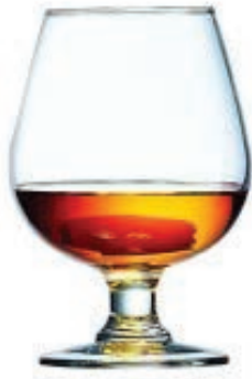
71079 Brandy 12oz