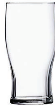
78365 Tulip 20oz