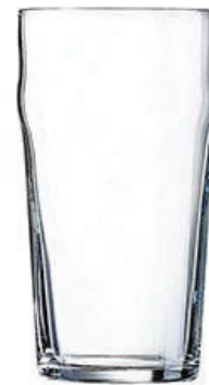
Nonic G5025 - 16oz 58220 - 19oz