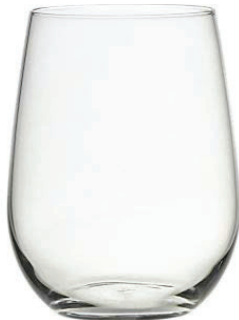
Stemless Wine D2015 - 5oz C8832 - 9oz C8303 - 15oz N2673 - 17oz C8304 - 21oz