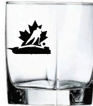
19374 Sterling DOF 13oz