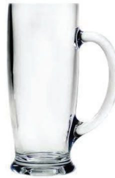
C8670 Ferdinand 18oz