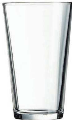
G3960 Mixing Glass 16oz