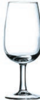
42258 Ice Wine 4oz