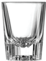
J6287 Fluted Whiskey 2oz