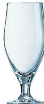
Cerveoise H0713 - 16.5oz