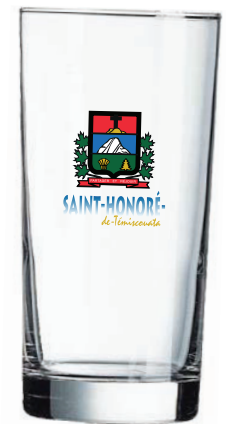
Executive Highball 53205 - 13oz 53214 - 16oz