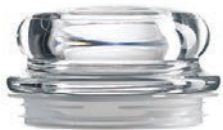
H8982 Dome Lid 36/case 16lbs