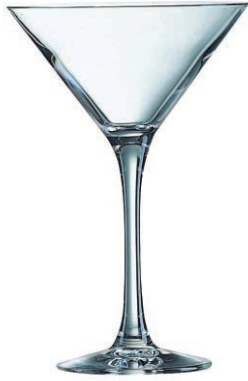
Martini Glass 09232 - 7.5oz 79320 - 10oz