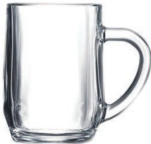
Haworth 61076 - 19.25oz