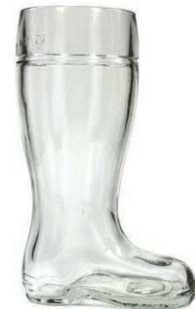
1L Beer Boot Glass