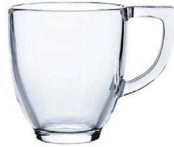
L6194 Cambridge 14oz