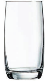
17198 Nordic Cooler 15.5oz