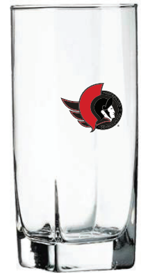
76497 Sterling Cooler 16oz