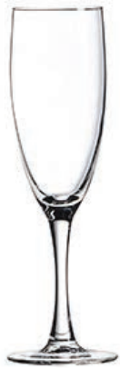
09192 Nuance Flute 6oz