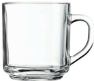
53337 Handy Mug 10oz