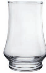
FK209 Kenzie Whiskey Taster 5.75oz