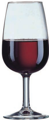
37260 Wine Taster 7oz