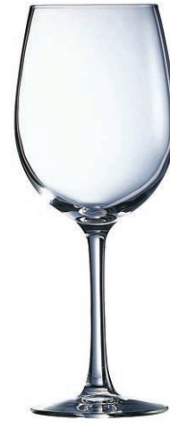
G1352 Cabernet 16oz