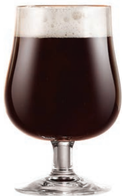
J8207 Belgium Craft 17oz