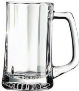
77346 Distinction 14oz