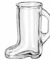
97038 Boot Shot 2oz