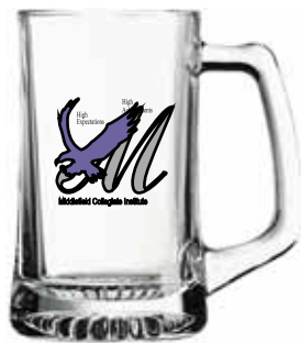
Sports Stein 15oz (53331) 25oz (53404)