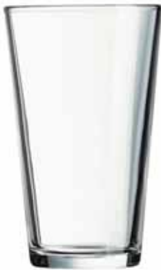
G3960 Mixing Glass 16oz