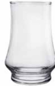
FK209 Kenzie Whiskey Taster 5.75oz