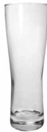
Oslo Pilsner 16oz H6283 & 20oz H6288