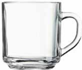
53337 Handy Mug 10oz