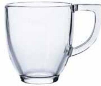
L6194 Cambridge 14oz