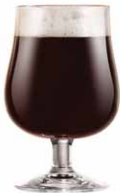
J8207 Belgium Craft 17oz