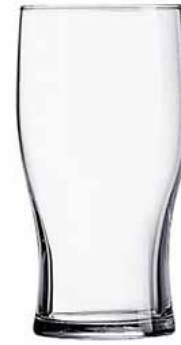
78365 Tulip 20oz