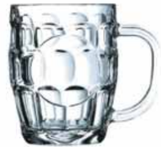
38518 Britannia 19.5oz