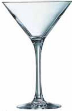
22760 Martini Glass 5oz