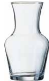
33040 Carafe 17oz