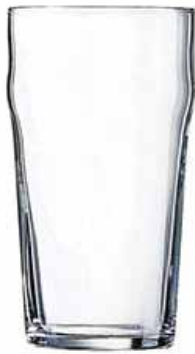
Nonic G5025 - 16oz 58220 - 19oz