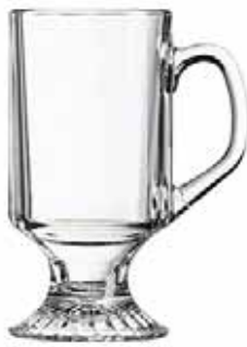
53403 Footed Mug 10oz