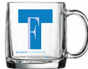
22097 Nordic 13oz