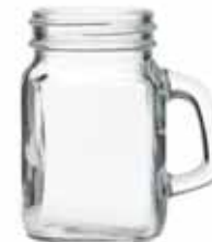
FK209 Mini Drinking Jar 4.75oz