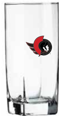
76497 Sterling Cooler 16oz