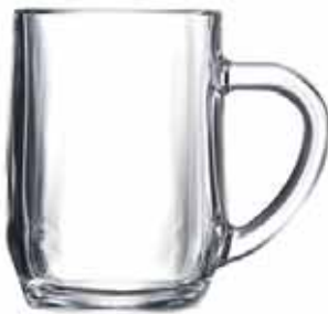
Haworth 61076 - 19.25oz