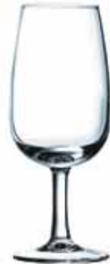
42258 Ice Wine 4oz