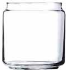
64844 Candy Jar 16oz