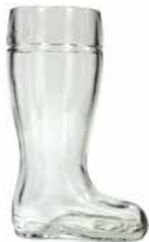
1L Beer Boot Glass