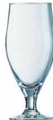
Cervoise H0713 - 16.5oz