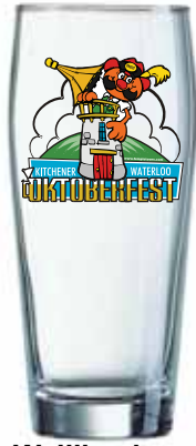
Wallibecher 16oz (C5872) 20oz (C3526)