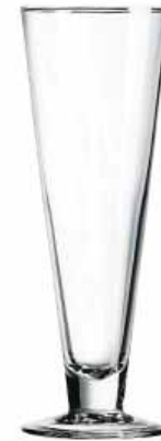
N2644 Classic 14oz