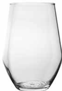
Concerto J6247 - 11.5oz J5661 - 19oz