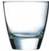
Elite N2792 - 10.75oz