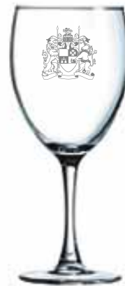
Nuance Wine 43874 - 8.5oz 09190 - 10.5oz