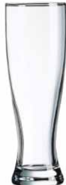
Grand Pilsner 12oz (21054) 16oz (21053) 20oz (19416) 23oz (19415)