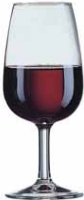
37260 Wine Taster 7oz