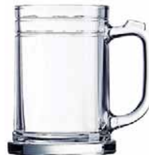
58664 Koblenz 15oz