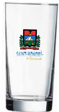
Executive Highball 53205 - 13oz 53214 - 16oz