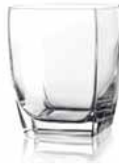
J8589 Sonata 10.5oz