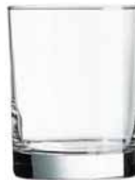
Executive Rock 11oz (53224) 14oz (53232)