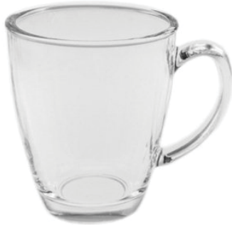
262 Glass Coffee Cup 12oz