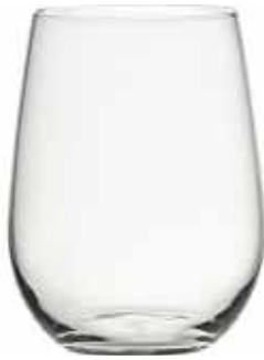
Stemless Wine D2015 - 5oz C8832 - 9oz C8303 - 15oz N2673 - 17oz C8304 - 21oz