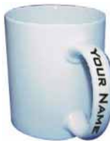
Print on Handle