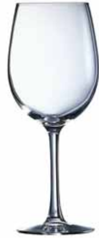
G1352 Cabernet 16oz