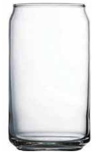
E5458 Plain Can 16oz