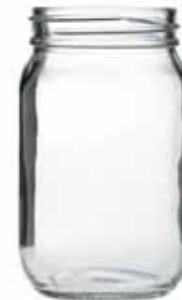
FK206 Mason Jar 15.25 oz