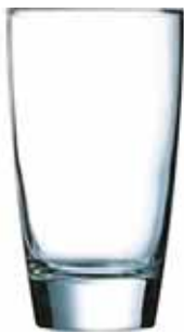
Elite N2798 - 19oz