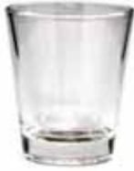
1032 Econo Shot Glass 2oz