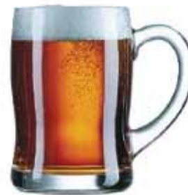
61619 Benidorn 15oz