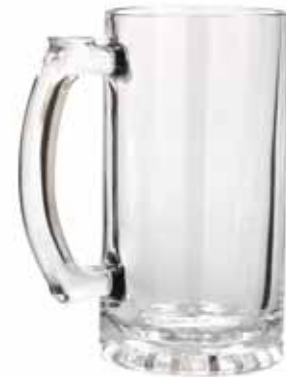
720 Econo Beer Stein 16oz