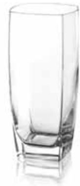
J8590 Sonata 15.5oz