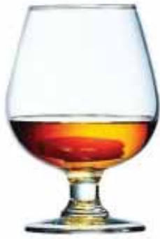
71079 Brandy 12oz