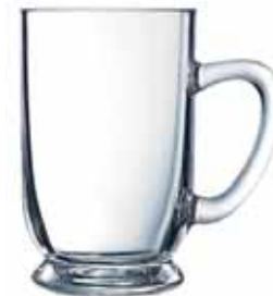
H7319 - Bolero 16oz