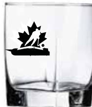
19374 Sterling DOF 13oz