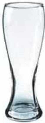
G3844 Pub Pilsner - 16oz 36230 Pub Pilsner - 20oz 36229 Pub Pilsner - 23oz