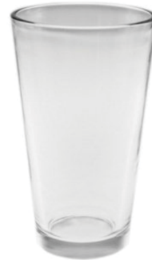
256 Econo Mixing Glass 16oz