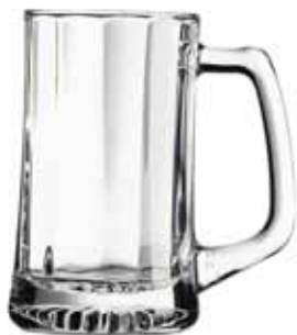
77346 Distinction 14oz