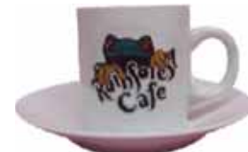
TC3 - 4oz