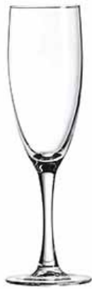
09192 Nuance Flute 6oz